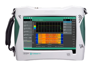
Field Master Pro MS2090A